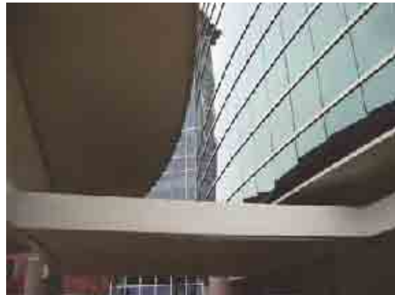
The Bon Secours Memorial Regional Medical Center Mechanicsville, Virginia