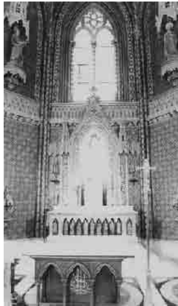
Chapel of the Sisters of Bon Secours, Paris, France

In 1998 Richmond Memorial Hospital, with whom the nursing school was affiliated, joined the Bon Secours Health System. The school was renamed the Bon Secours Memorial School of Nursing. In 2010 the school took a bold step. In response to growing evidence showing a positive relationship between a nurse's educational level and positive patient outcomes, the school launched a Bachelor of Science in Nursing degree. In accordance with that change and with accreditation by the Accrediting Council of Independent Colleges and Schools, the school started doing business as the Bon Secours Memorial College of Nursing.