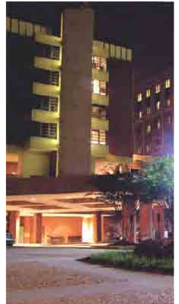
Bon Secours St. Mary's Hospital, Richmond, Virginia

Certified Nurse Educator National League for Nursing Accrediting Center