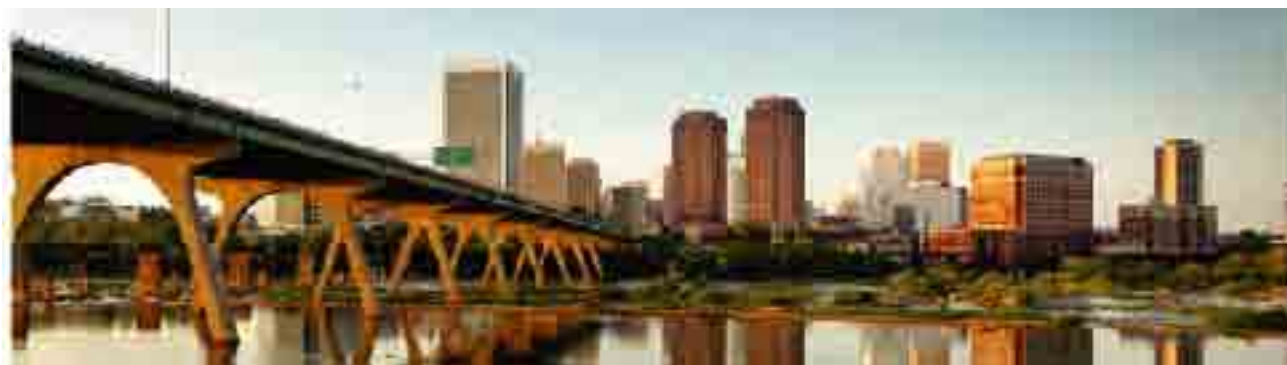
The Communities of Greater Richmond, Virginia