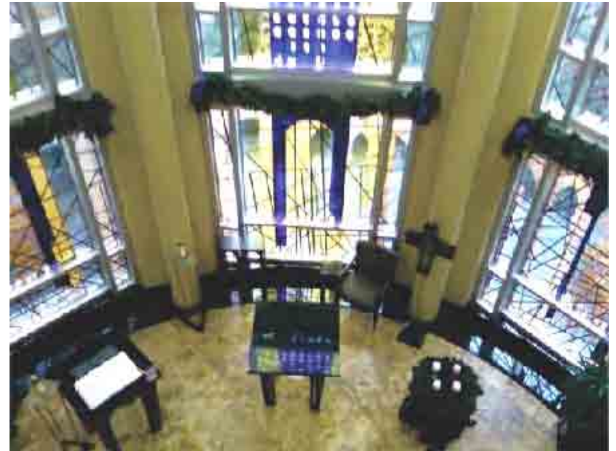
Bon Secours St. Francis Hospital Chapel, Richmond

ARRA-Equipment to Enhance Training for Health Professionals, Health Resources and Services Administration