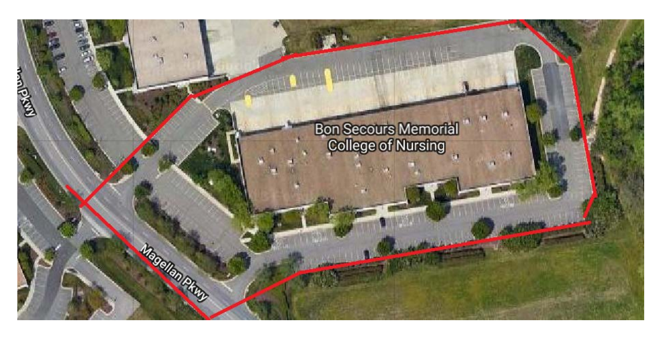
BSMCON Non-Campus: 7900 Shrader Road